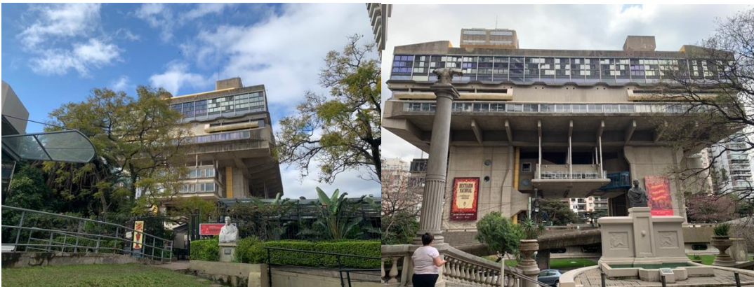
Biblioteca Mariano Moreno