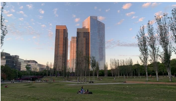
Parque Mujeres Argentina