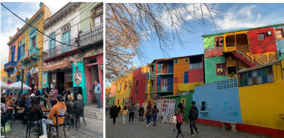
Caminito (la Boca)