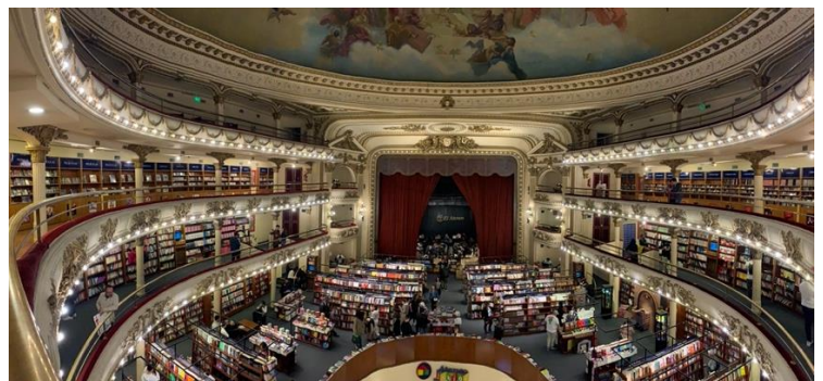
Librería el Ateneo